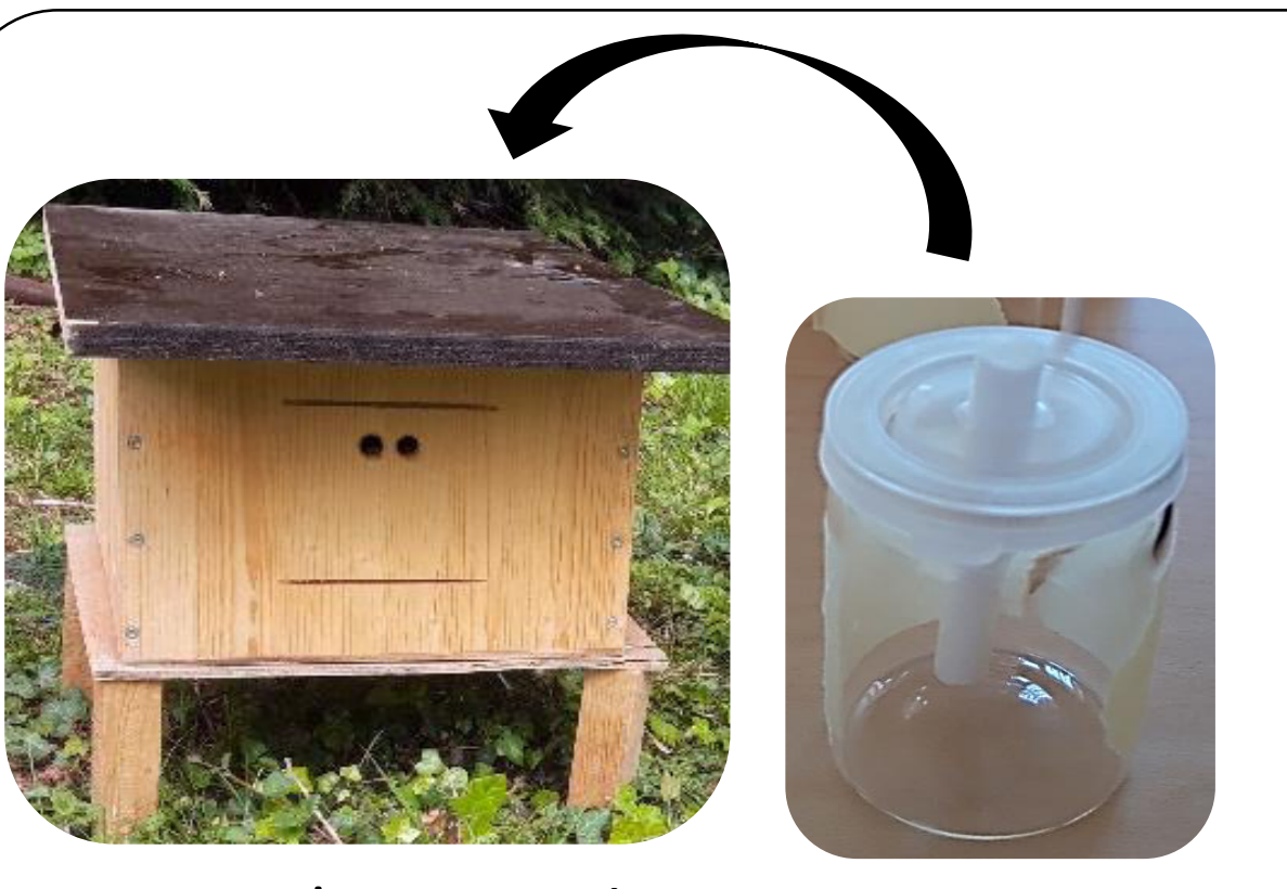
Figure 1 | Fungicide exposure. Syrup spiked with Ortiva (except control) placed inside nest and often exchanged

One set of colonies received a field-typical sequence of doses (1170 ppb, 656 ppb, 70 ppb, 16 ppb on days 0-3, respectively and 5 ppb on days 4-9) and additional sets of colonies received either a multiple or a fraction of these concentrations (concentration factors: 0, 0.5, 1, 2, 4, 8; Fig. 1). Per concentration factor, seven commercial B. terrestris colonies were used (i.e., 42 in total).