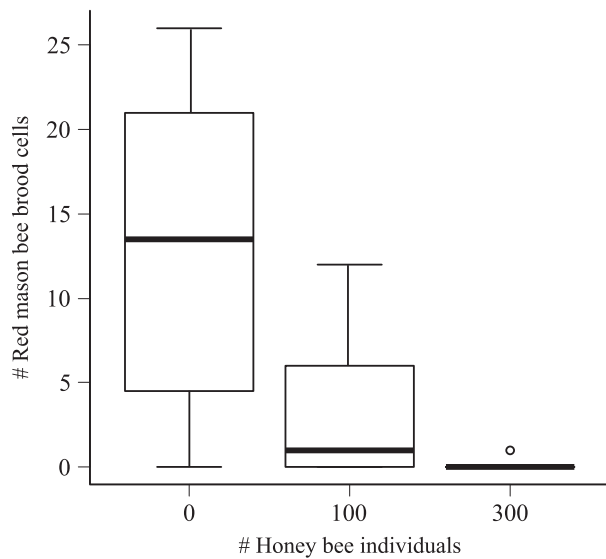
Figure 3. Number of red mason bee brood cells ( n = 24 , df = 21 , GLMM, P < 0.001 ) in cages without honey bees, with 100 and with 300 honey bee individuals.

reduced flower visits or abundances of wild bees with high densities of honey bees (Schaffer et al. 1983; Forup and Memmott 2005; Shavit et al. 2009; Hudewenz and Klein 2013) (although others did not find this correlation (Garibaldi et al. 2013)). Aizen and Feinsinger (1994) investigated the effect of habitat fragmentation on flower visitors and found that honey bees increasingly visited small flower patches, while wild bee visits decreased. On large flower patches, they found decreased honey bee visits but increased wild bee visits. This supports our findings that wild bee visits decrease when honey bees are present in small habitat patches where floral resources are limited.