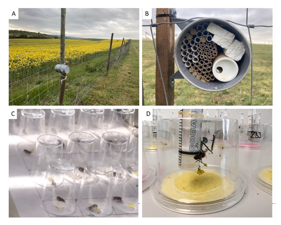
Fig. 1. (A) Trap nest mounted on a pole next to an oilseed rape field and (B) a trap nest consisting of 60 cardboard tubes of varying inner diameter. (C) Osmia brevicornis in an individual oral exposure assay and (D) during individual housing in the laboratory.

The inner diameter of nesting tubes preferred by O. brevicornis has been proposed to be 5 mm, which is at the lower range of the 5-9 mm diameters preferred by O. bicornis (Westrich, 2019). To quantify the effect of inner tube diameter on nest initiation, brood number, sex ratio and body size of offspring, we stocked trap nests with 20 commercially available cardboard tubes each (length 14 cm) of 4, 6, and 8 mm inner diameter (N = 60 tubes per trap nest; LBV Naturshop, Hilpoltstein, Germany; Fig. 1B). Trap nests in the cocoon supplementation treatment were equipped with a container housing 51 O. brevicornis cocoons (Fig. 1B). These cocoons were collected from a trap nest adjacent to an OSR field in the previous year in the federal state of Thuringia, Germany, where O. brevicornis had nested spontaneously. As sex dimorphism is common in Osmia species, whereby small cocoons generally contain males and large cocoons contain females (Seidelmann et al., 2010), smaller and larger cocoons were evenly distributed between the starting populations.