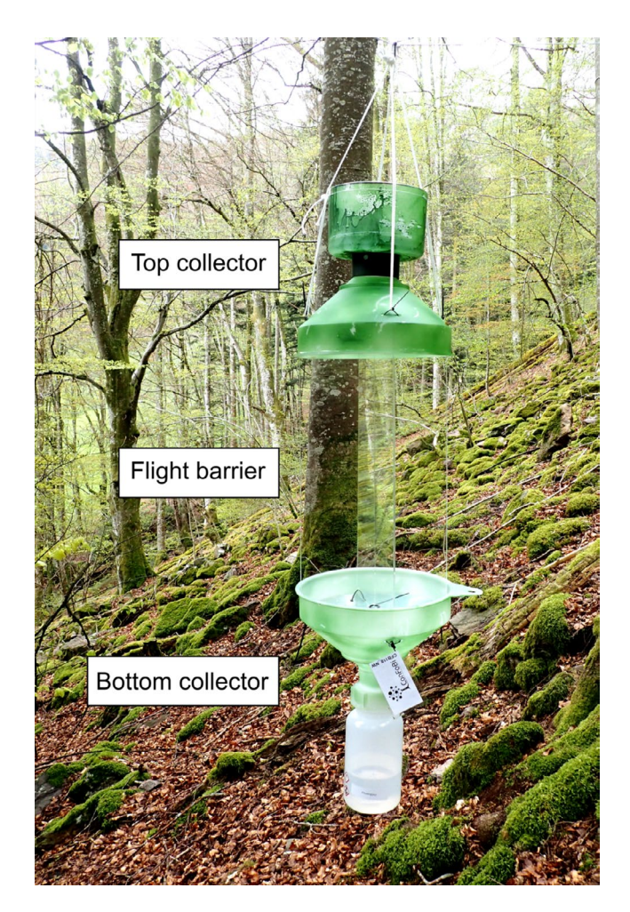
FIGURE 1 Modified window trap supplemented with top collection unit. Two transparent crossed windows serve as flight barrier. Funnels beneath and on top of the windows serve as sturdy attachments between windows and collectors and direct arthropods into the collectors. For details see Supporting Information S1

We operated the 270 traps continuously between mid-March and mid-August in 2017. Catches were collected at 4-weekly intervals, resulting in five sampling periods. Arthropods were stored in